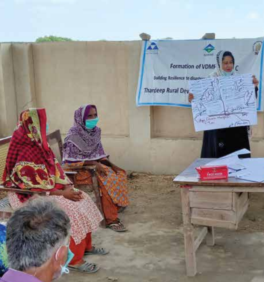
Under the BRDCC Project, the community members were facilitated in preparing village disaster management planning at village Sher Muhammad Dawach, Union Council Pir Tarho, District Dadu, Sindh